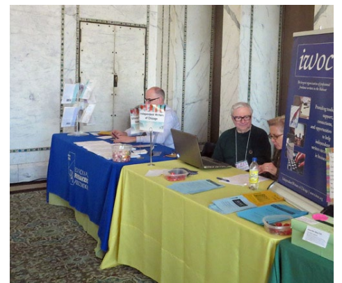
Photo from Chicago Creative Expo